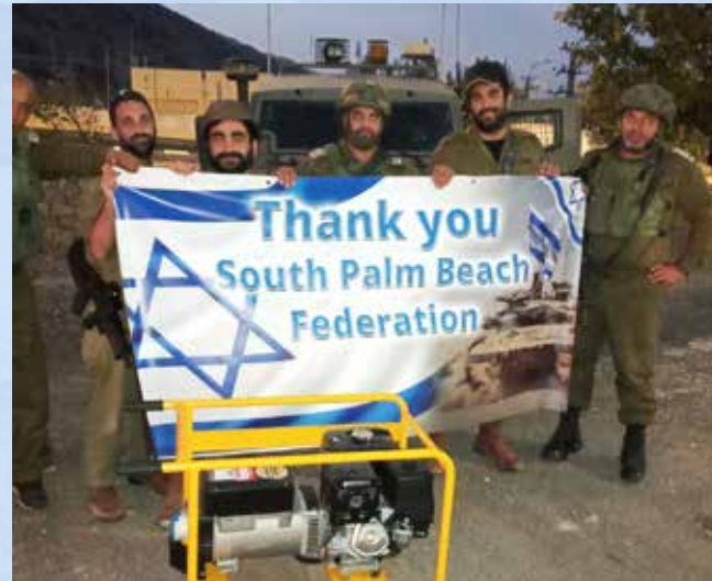
Supporting Israeli soldiers via our partner agency, Yashar LaChayal